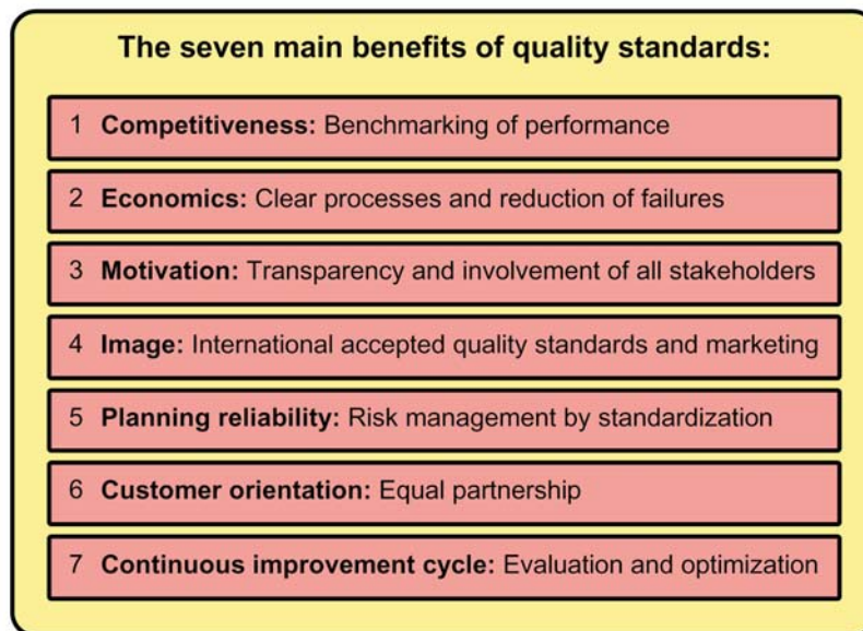
Figure 1: The seven main benefits of quality standards

Quality standards have got an impact in particular on seven main factors: The following figure lists these factors together with the main benefits of quality standards at a glance that can be identified in general related to the seven factors. 2